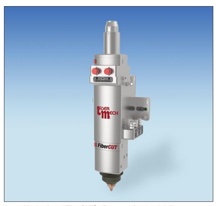
Laser Mechanisms' FiberCUT® 2D processing head delivers cutting-edge performance for flatbed systems up to 6 kW.